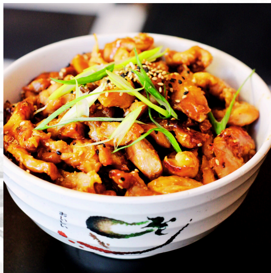
CHICKEN TERYAKI RICE BOWL